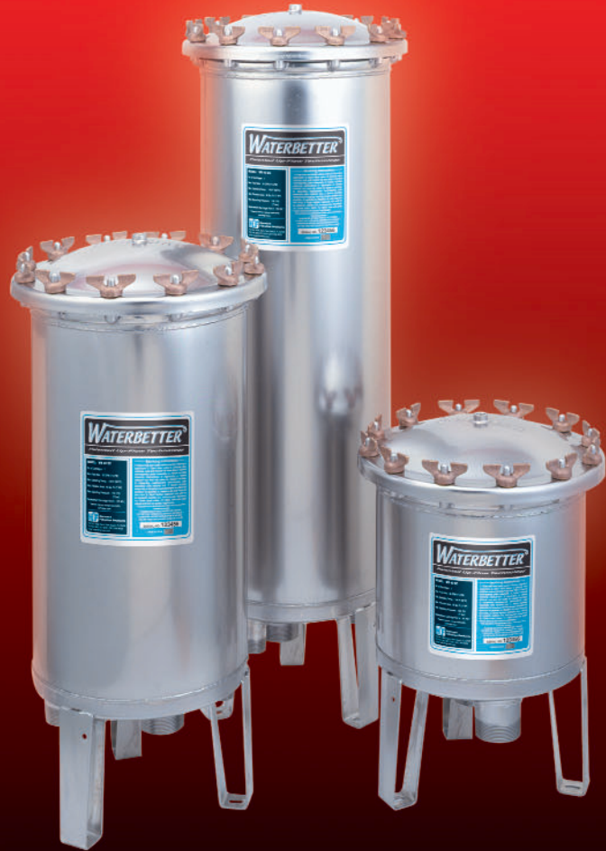
Single cartridge housings for genuine Harmsco® Hurricane Cartridges.