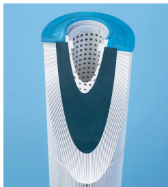
Hurricane A/C cartridge

*Results may vary and are based on flow and other factors. **Approx.